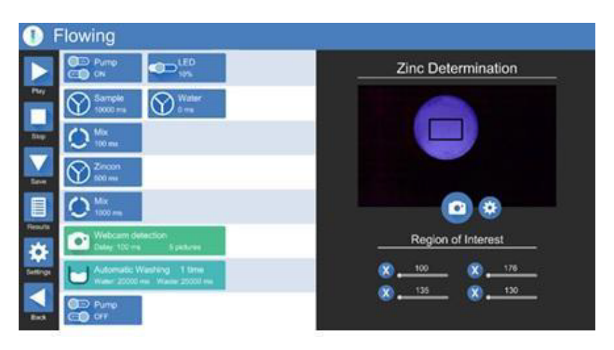
Figure 2. Software "Flowing" screenshot, developed for analysis control

According to British pharmacopoeia, ^{11} the reference method for zinc oxide determination in ointments is the complexometric titration described as follow: 150 mg of the sample is dissolved in 10 mL of 2.0 mol L^{-1} acetic acid aqueous solution and 50 mg of 1.0 % (w w ^{-1} ) xylenol orange in potassium nitrate mixture is added. Solid hexamine is added until the solution color changes to violet-pink. Then added 2.0 g of hexamine and the solution is titrated against Na_EDTA \cdot 2H_2O standard solution until the color violet-pink changes to yellow.