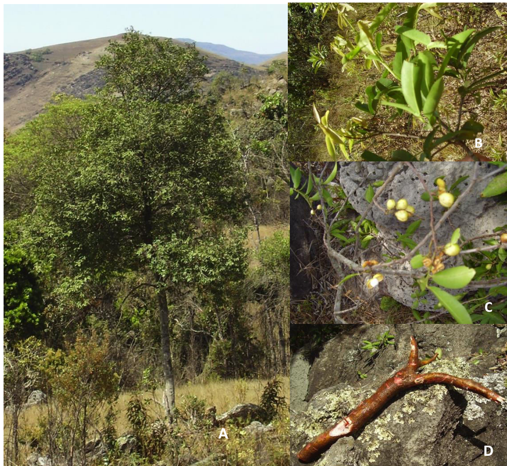
Figure 1. Photos of M. salicifolia Reissek, that is commonly found in Serra de Ouro Branco, MG, Brazil. A: Tree, B: leaves, C: seeds and D: part of the root

M. robusta 24 and other species of the Celastraceae family of natural occurrence in Minas Gerais, Brazil.